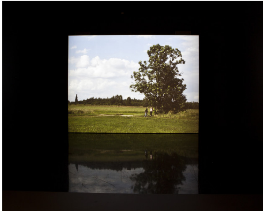
Sharon Lockhart, Installation view of Rudzienko at The Arts Club of Chicago, 2016.

While images of Milena are largely absent from the Arts Club exhibition, she serves as the crucial tie between the girls from the Youth Center and Lockhart. Rudzienko is a product of workshops that the artist organized for Milena and the other girls living at the Center that focused on the development of personal narratives through performance, writing, and dance. Together they choreographed scenes for the film and staged conversations as a means of building self-confidence and trust. These exercises were based on the practices of early twentieth century Polish educator Janusz Korczak, the author of How to Love a Child (1919), who advocated for the respect of the emotional intelligence of children.