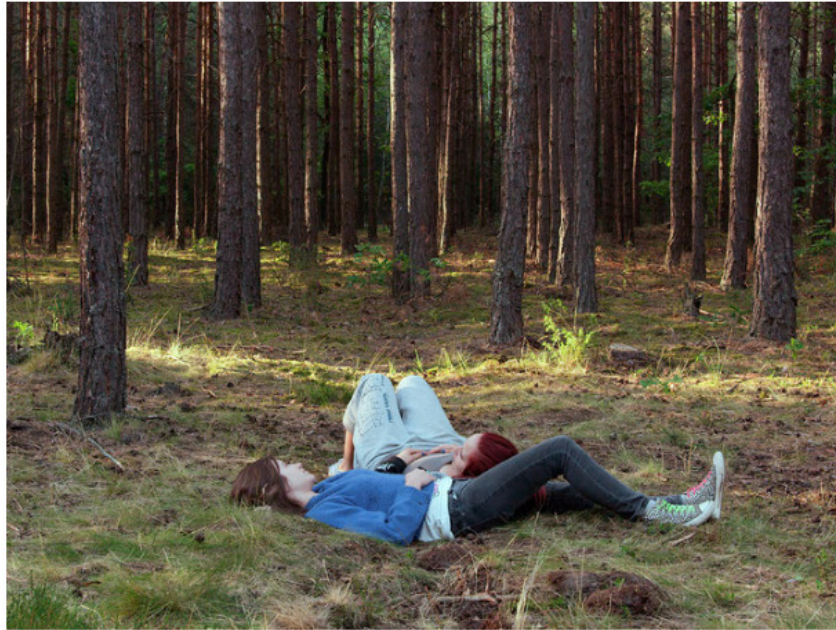
Sharon Lockhart, Still from Rudzienko , 2016.

The other eight vignettes—interspersed with text from dialogues performed by the young women—unfold in outdoor spaces near Rudzienko, which is on the outskirts of Warsaw. Lockhart situates the girls in close conversation with the rural landscape; they are embedded within the trees, bushes, and grasses of the Polish countryside. In one shot, three large trees, backlit on a cloudy horizon, dwarf the figures of two girls who slowly come into view. In the dark, the bright image reflects onto the cool, stone floor of the Arts Club gallery.