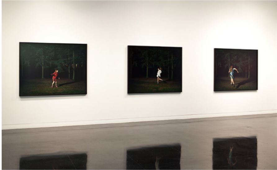
Sharon Lockhart, Installation view of When You're Free You Run in the Dark at The Arts Club of Chicago, 2016.