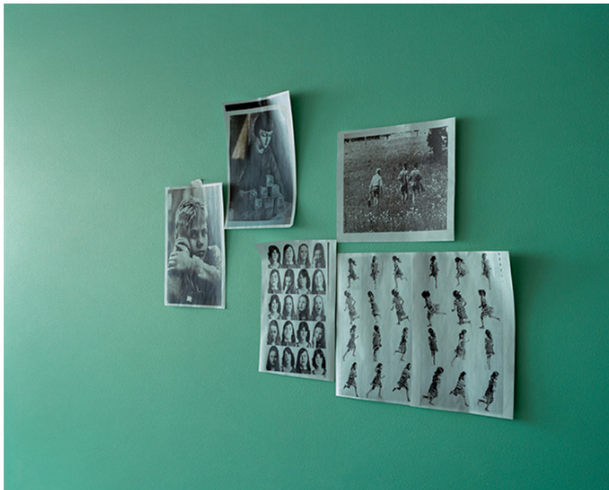
Sharon Lockhart, Milena, Radawa , 2016, Chromogenic print, 32 1/2 x 40 1/2 inches.

The other eight vignettes—interspersed with text from dialogues performed by the young women—unfold in outdoor spaces near Rudzienko, which is on the outskirts of Warsaw. Lockhart situates the girls in close conversation with the rural landscape; they are embedded within the trees, bushes, and grasses of the Polish countryside. In one shot, three large trees, backlit on a cloudy horizon, dwarf the figures of two girls who slowly come into view. In the dark, the bright image reflects onto the cool, stone floor of the Arts Club gallery.