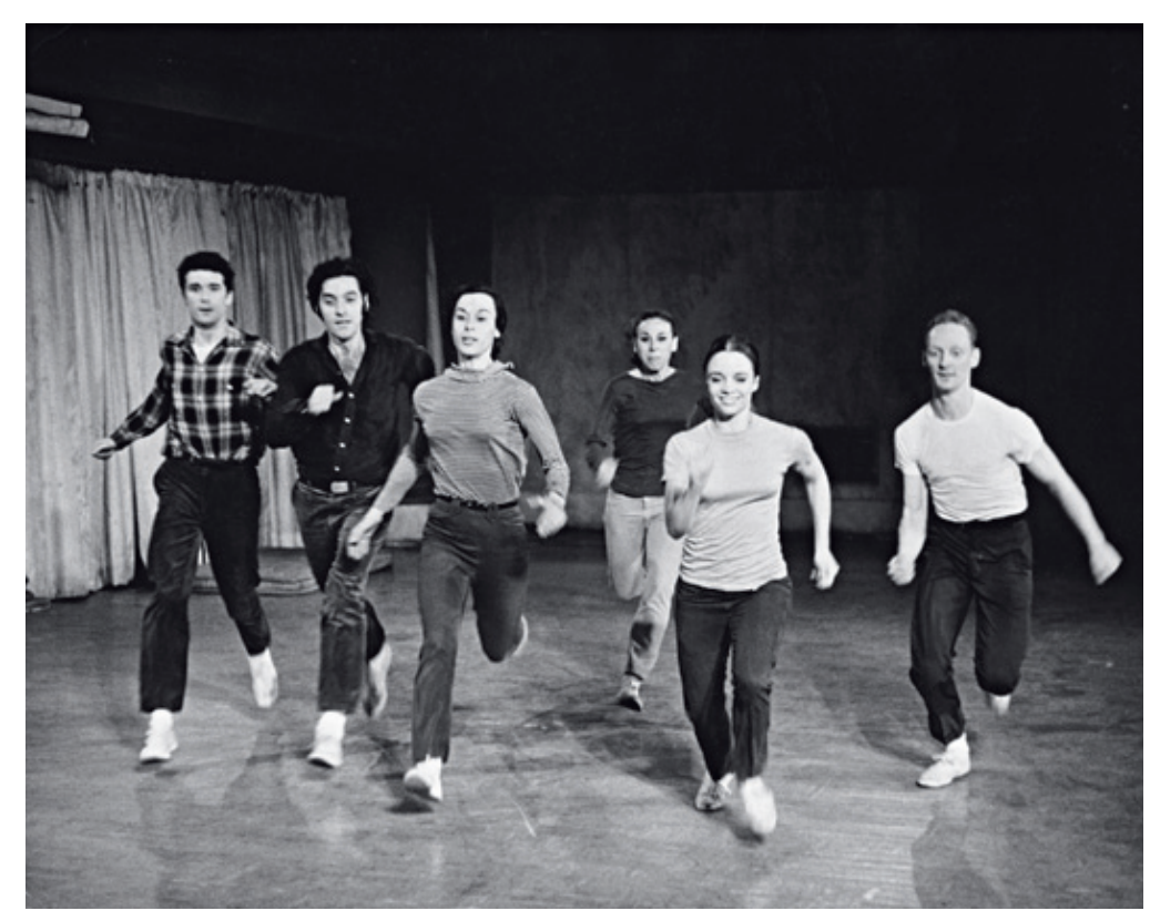
Fig. 2. Yvonne Rainer, The Mind Is a Muscle, as performed at Judson Memorial Church, May 24, 1966