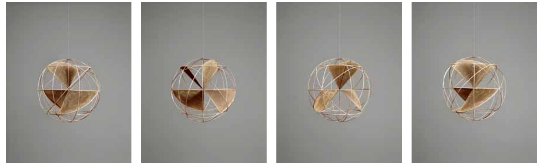
Above: Sharon Lockhart, Models of Orbits in the System of Reference, Eshkol-Wachman Movement Notation System: Sphere Two at Four Points in Its Rotation , 2011, four color photographs, each 19 3/4 x 15 3/4”. From the series “Spheres,” 2011.