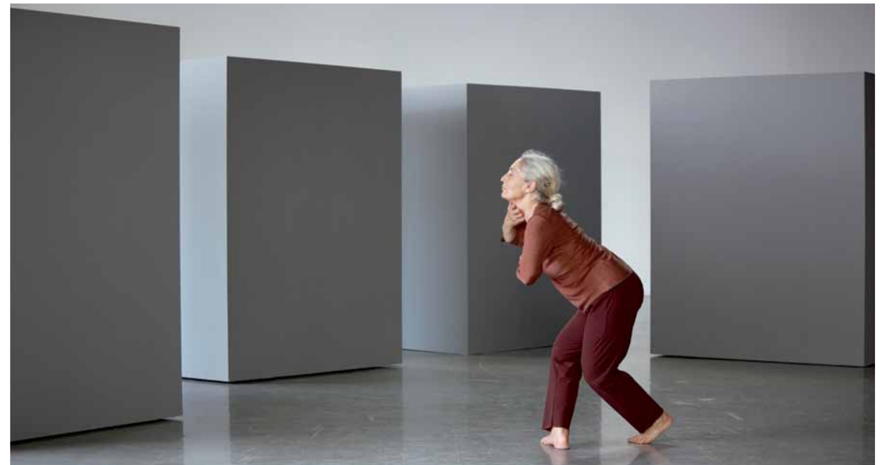
Below: Sharon Lockhart, Four Exercises in Eshkol-Wachman Movement Notation , 2011, color HD video, continuous loop. Production still. Ruti Sela.