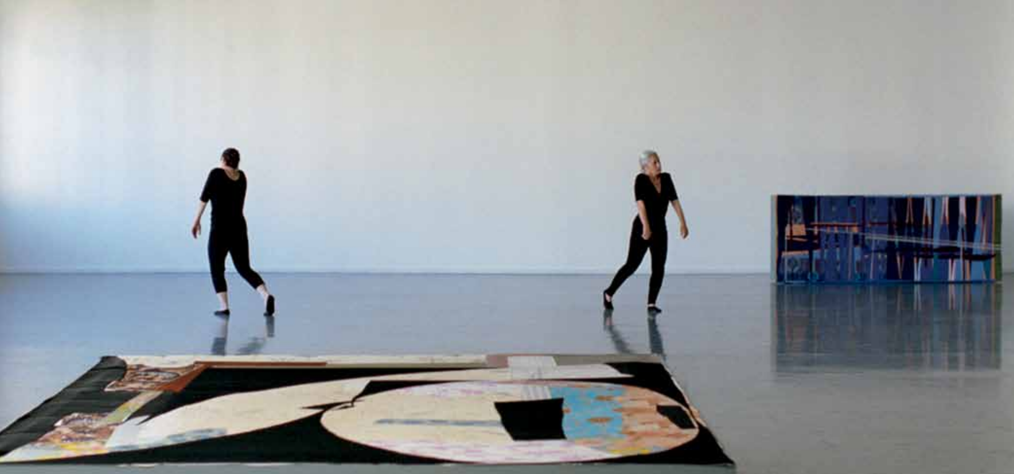
Sharon Lockhart, Five Dances and Nine Wall Carpets by Noa Eshkol, 2011, color film in 35 mm transferred to HD video, five-channel installation, continuous loop.